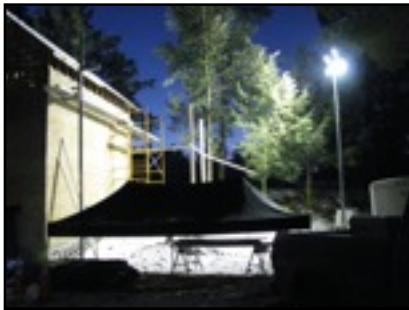
Top: Early stages of construction.